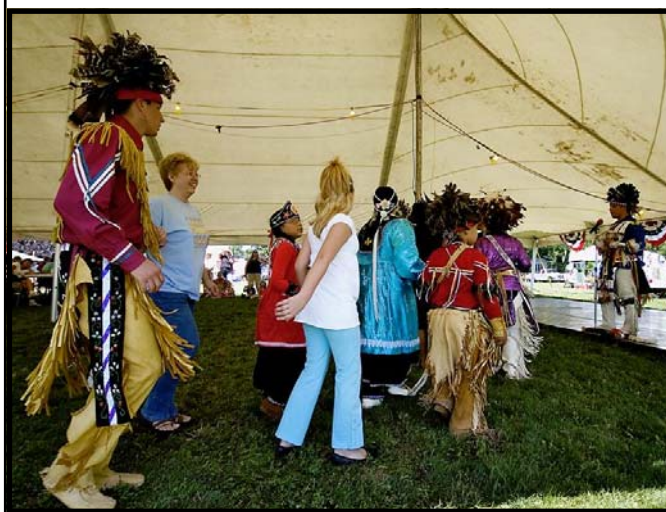
Niagara River Dancers