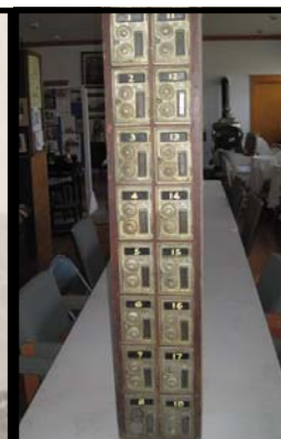
Post Office boxes in Pikes Store