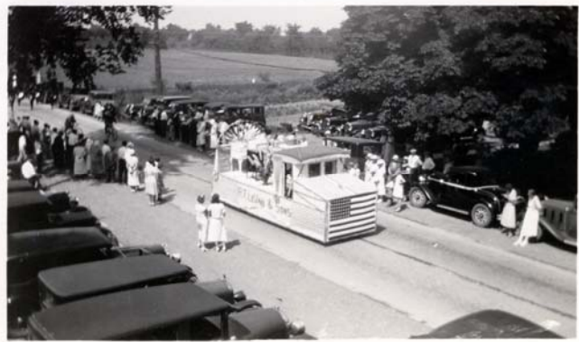
Float in Sanborn Fire Company Parade

Our home was only a short block from the RR tracks. Once in a while we would hear a light knock at our front door. It would be a hobo riding the rails looking for food. My Mom always seemed to have a little extra food that she gave them. I found out later that hobos passed the word around where they could expect to receive a hand-out if needed. Doubt if anyone would open the door to a shabby stranger in these days, especially if home alone.